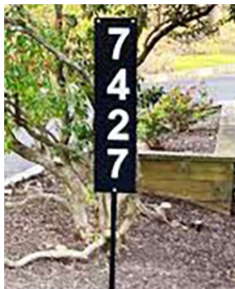
HELP US FIND YOU! 3+ inch white numbers visible from the road at night are best.