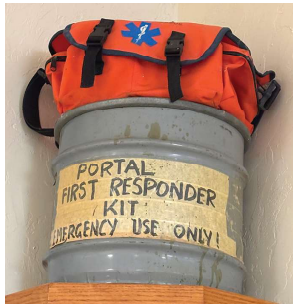
The Original "Bucket" kit contained basic first aid supplies to breathe, splint and stop bleeding.

After everyone aced their exams, we were let loose in Rodeo and Portal with a responder kit. There was literally a bucket, still visible at the Portal Rescue classroom, which