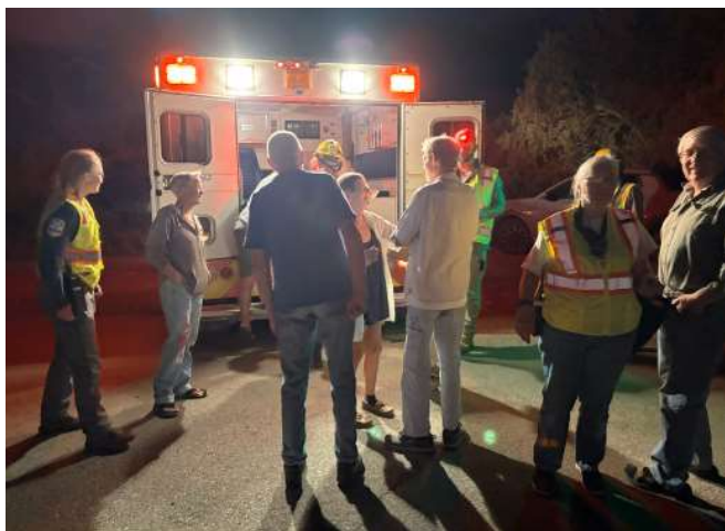
MASS CASUALTY SIMULATION TRAINING: Ten Portal residents with 3 cars volunteered to enact a multi-car wreck so Portal Rescue EMTs, firefighters and radio operators could practice.