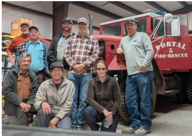
Some of our noble Portal Rescue crewmembers!