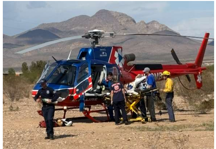
Medevac helicopter making a desert call.

In addition to volunteer support, donations are essential to sustaining our nonprofit, non-government-funded organization. I want to extend my heartfelt appreciation to our generous community members and donors outside the community for supporting Portal Rescue through another year. Both our Bowls and Spoons fundraiser and our annual donation drive successfully generated the funds needed to balance our 2025 budget and place us in strong financial standing for the upcoming year. A sincere thank-you to everyone who contributed.